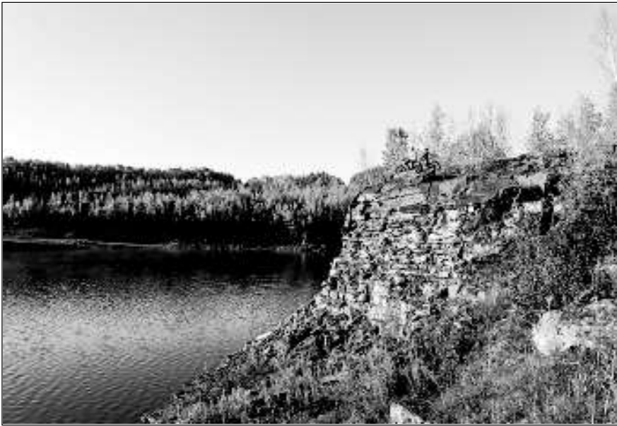
Redhead Mountain Bike Park – Chisholm, MN