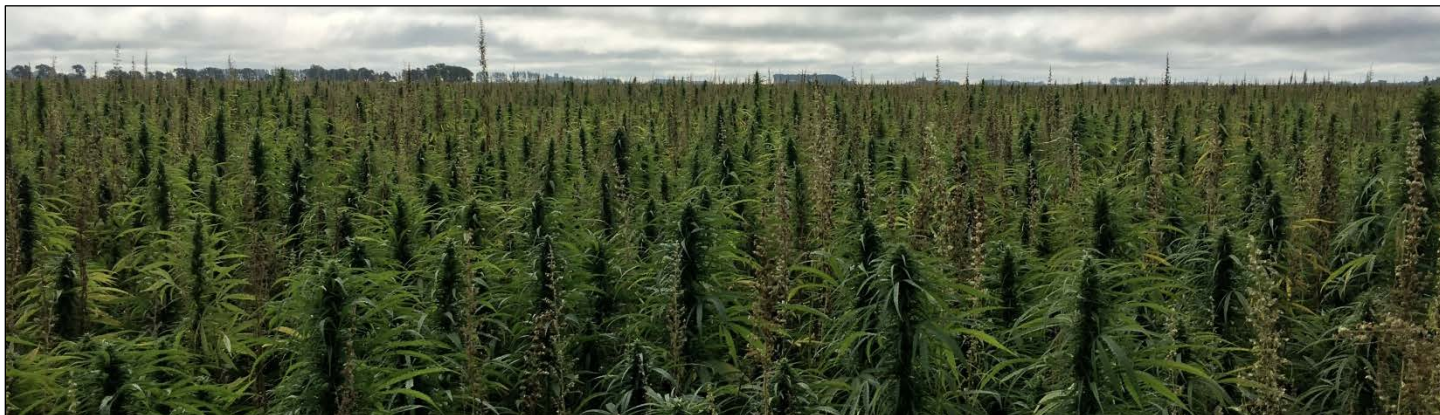
Figure 3: Hemp Field in Polk County

None of the growers reported applying pesticides. There are no pesticides that are labeled for use on hemp. Seven growers reported that they used glyphosate or other pre-emergence herbicide to kill weeds in the field prior to planting. One grower reported that the hemp was very sensitive to residual herbicides from previous seasons that was still present in the soil and advised growers to check their labels carefully when considering to rotate hemp with other traditional row crops.