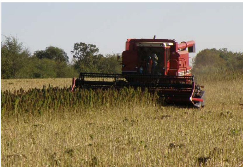
Figure 4: Combining Hemp Grain

Many growers commented that the harvested grain was difficult to clean and dry. Because of the wrapping problems when the crop gets too dry, and also the specter of seed shattering and bird predation, it is better to harvest a little earlier than you would normally think to. Because of that, you end up with high-moisture grain that has to be dried immediately to avoid spoilage. Also there was a lot of green material and weed seeds in the grain, and this made it more difficult to clean and dry down properly. There were 4 growers that had grain get hot and spoil because it did not get on air immediately. This can be a common issue with oilseed crops, so growers that don't have experience with that will need to handle their harvest using different methods.