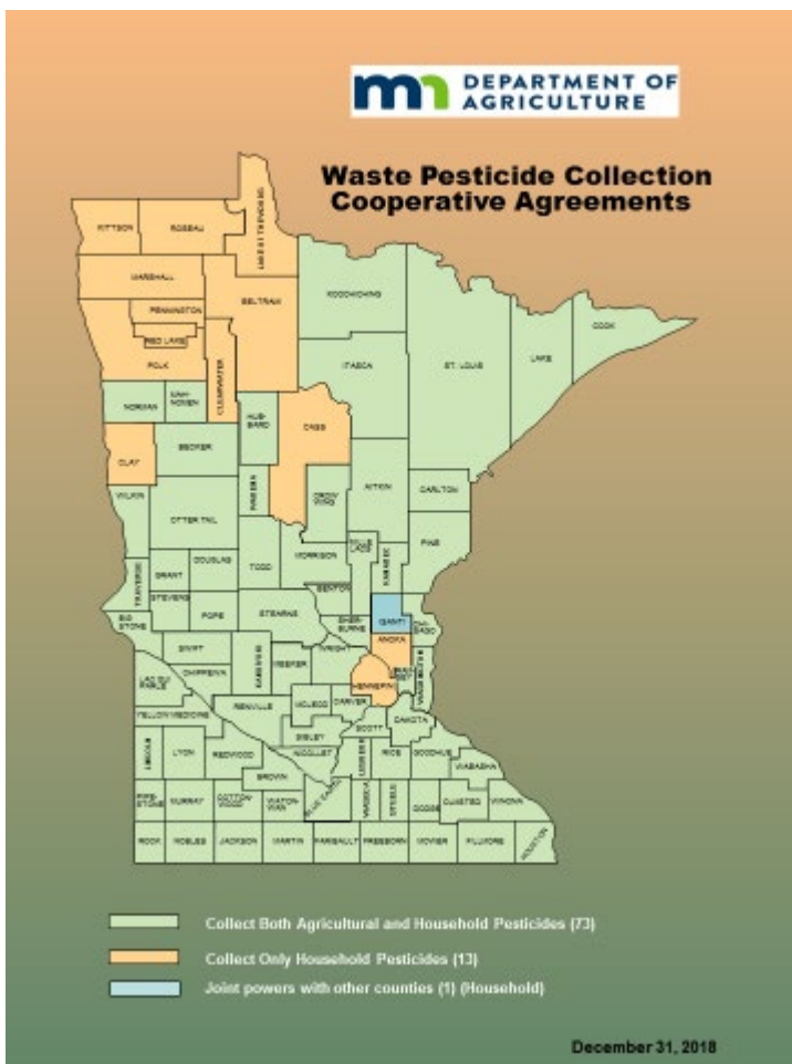
Figure 1. A state map showing cooperative agreements.