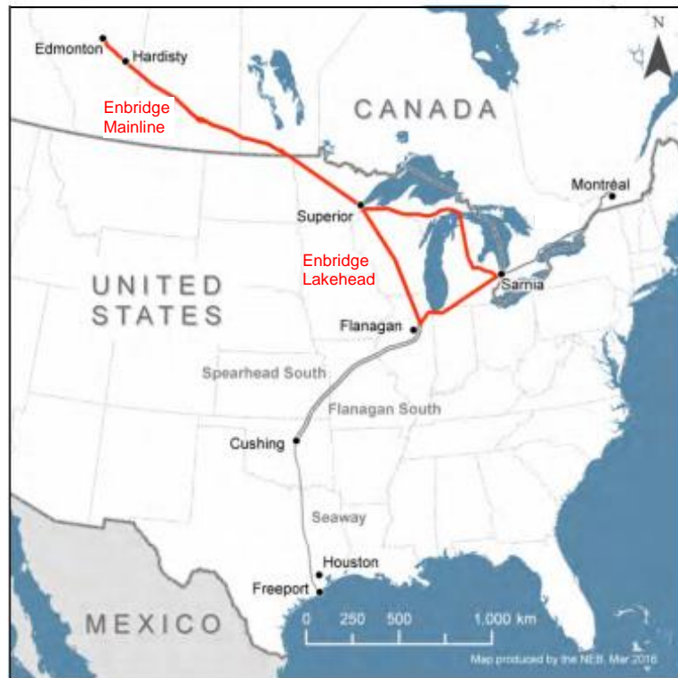
Figure 1: Enbridge's Mainline and Lakehead Systems

Source: Government of Canada, National Energy Board, Canada's Pipeline Transportation System 2016 , https://www.neb-one.gc.ca/nrg/ntgrtd/trnsprttn/2016/cnds-ppln-trnsprttn-systm-eng.pdf , p.32. (This map is a reproduction of a version available on the NEB website. The reproduction has not been produced in affiliation with or with the endorsement of the NEB.)