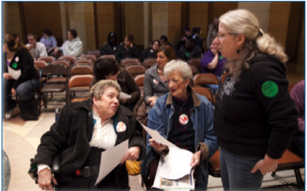
MSCOD staff and council members partake in Advocacy Day at the Capitol

Much progress has been made on removing barriers for people with disabilities. Despite that progress, we continue to live in a Minnesota that has barriers for people with disabilities. People with disabilities continue to experience disparity with lack of adequate accessible transportation, housing, as well as physical and