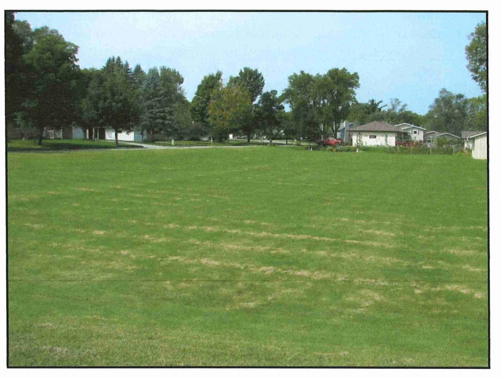
FIGURE 3. TEST AREA 2, VIEW TO SOUTHWEST

very dark grayish brown (10YR 3/2), clay loam A horizon overlying a dark brown (10YR 3/3) clay loam containing mottles of dark yellowish brown (10YR 4/6) clay subsoil, which gave way to subsoil at an average depth of 50 cm below the surface of the A horizon. In ST 1 and ST 4, which were located closest to Carol Lane, this profile was capped by an average of 12 cm of modern, very dark grayish brown (10YR 3/2) topsoil, over a 9-cm thick lens of gravels presumably associated with the construction of the roadway. All shovel tests were negative for cultural material save two pieces of slag and a piece of brown bottle glass in the shovel tests proximate to Carol Lane. The documented shallow soil profile within Area 2 is indicative of an area that has been intensively cultivated in the past with the entire soil profile exhibiting evidence of having been disturbed to subsoil by plowing. No further archaeological work is recommended at this location.