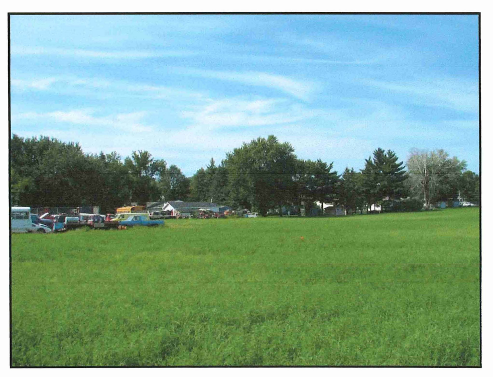
FIGURE 5. TEST AREA 4, VIEW TO NORTHWEST