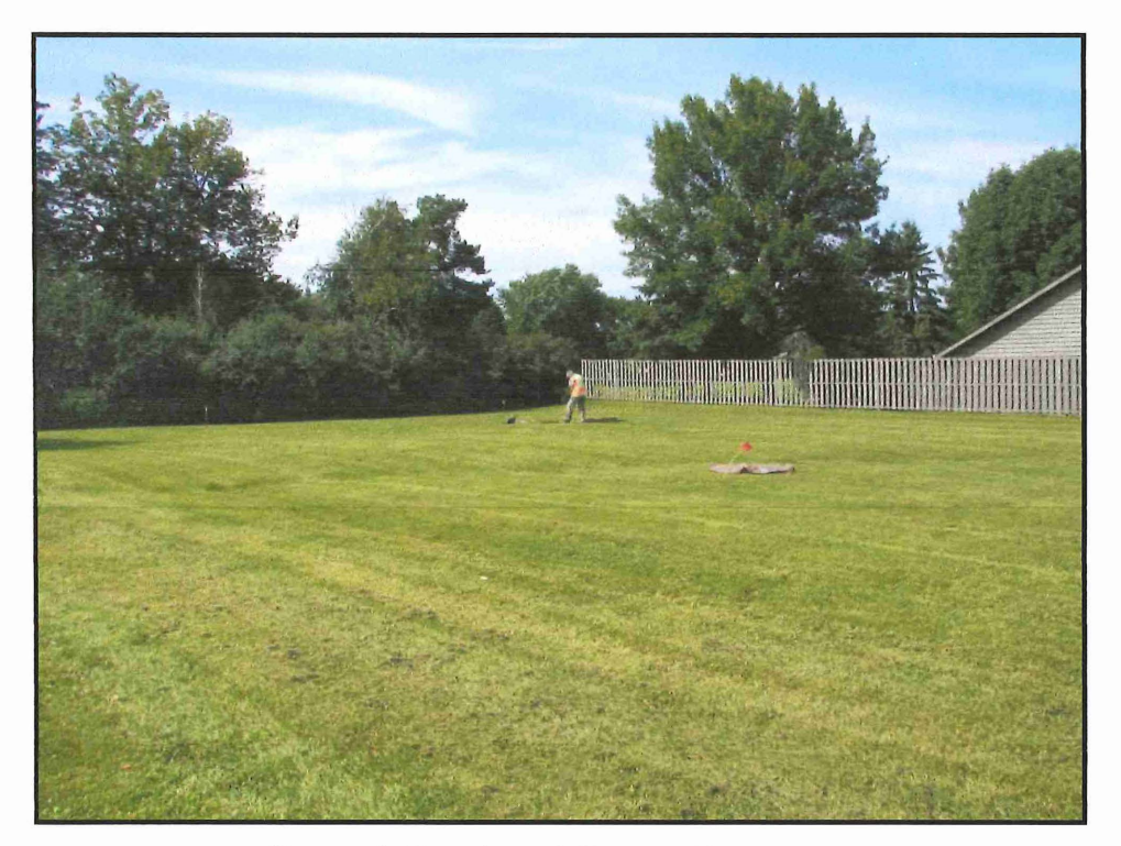
FIGURE 4. TEST AREA 3, VIEW TO NORTHWEST