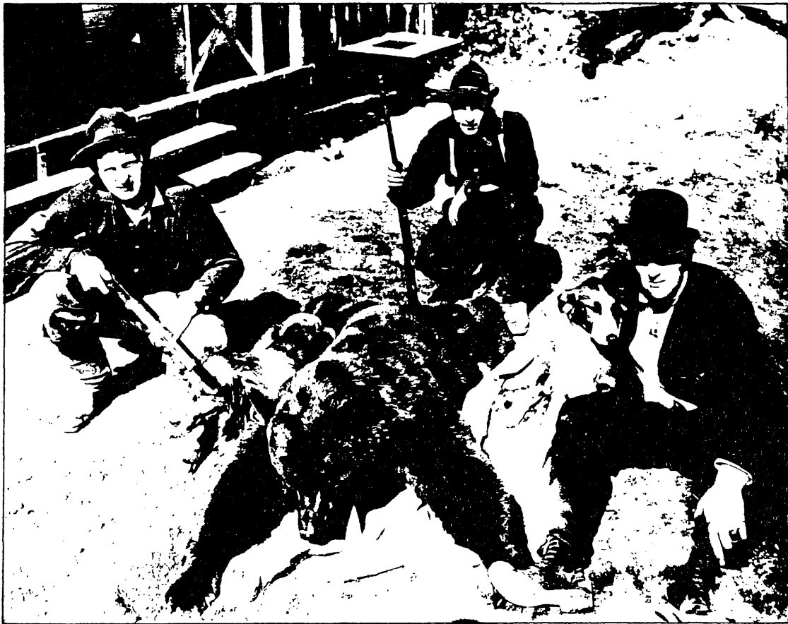
Bear hunting, circa 1910.