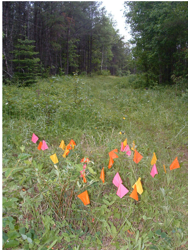
Photo 2. Polymet 5, FS Road 108c.