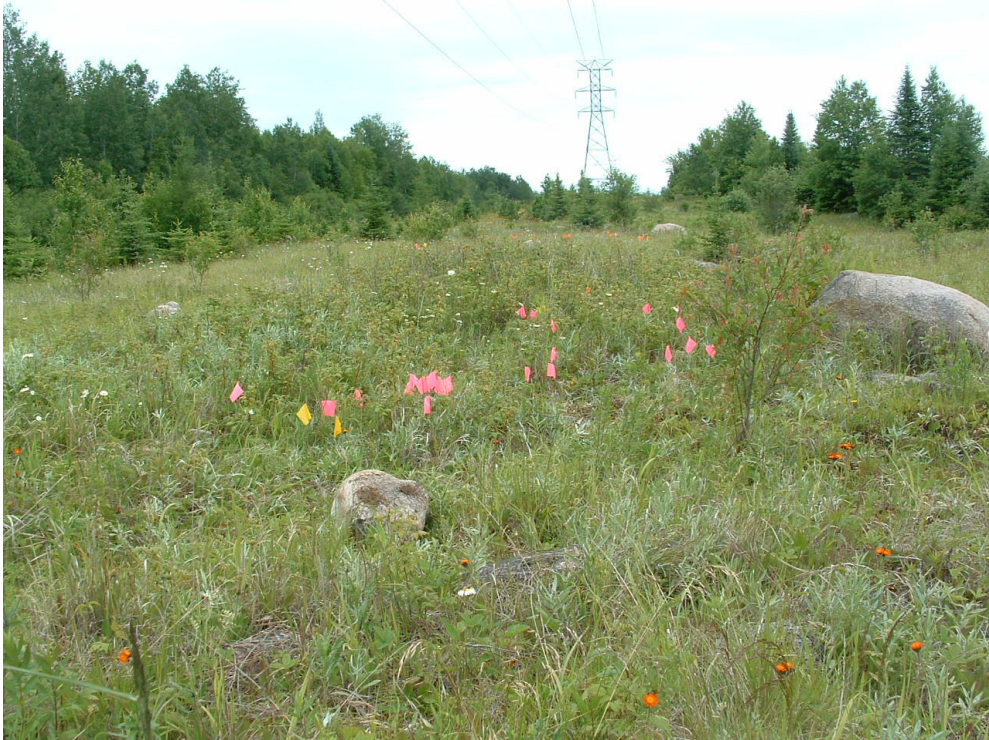
Photo 9. Polymet 16, power line right-of-way.