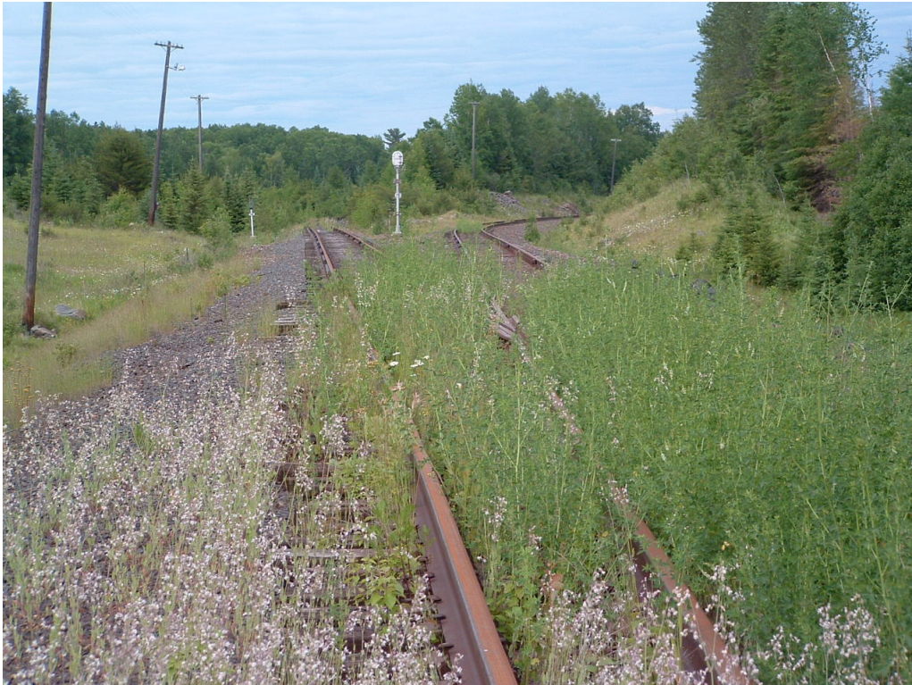
Photo 11. Railroad right-of-way.