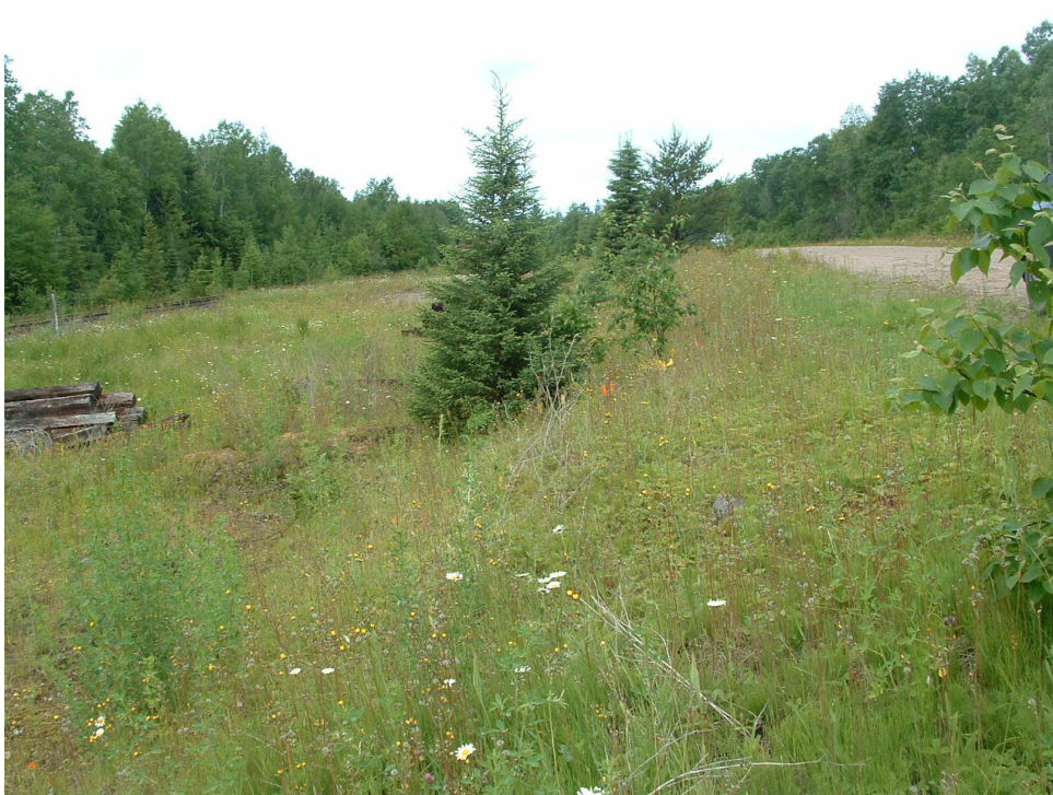
Photo 8. Polymet 15, Walton pop 1, Dunka Road and FS Road 109 (looking west).