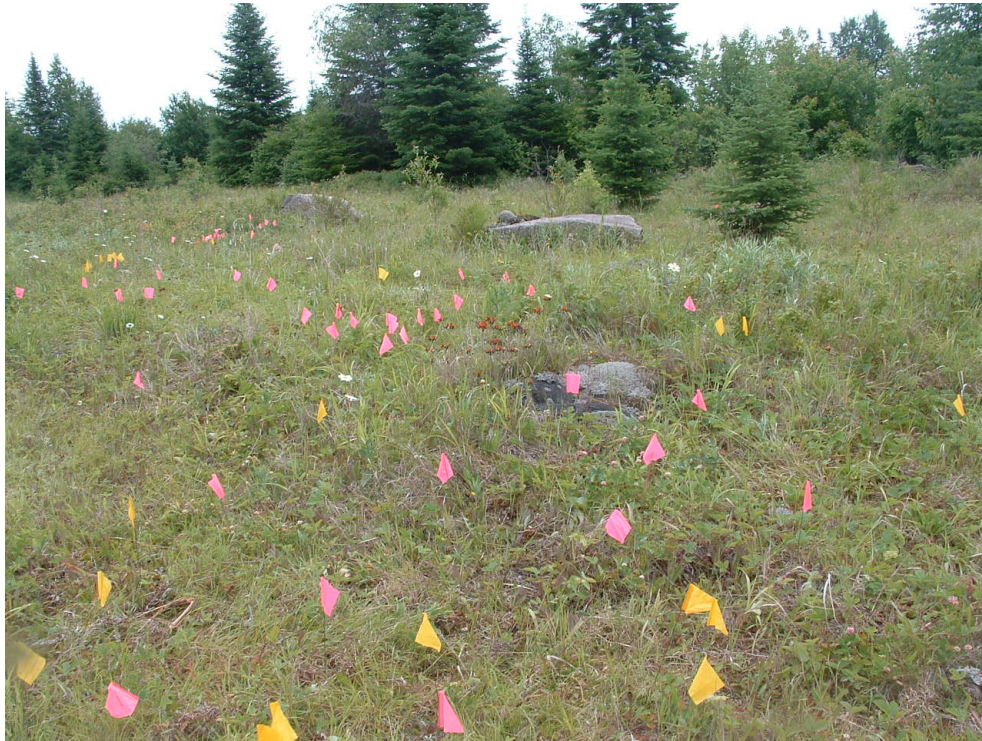
Photo 10. Polymet 16, power line right-of-way.