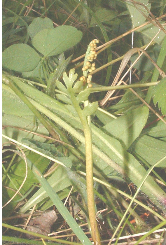
Photo15. B. michiganense (Polymet 3).