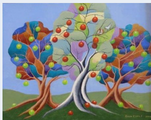
"Three Apple Trees" by Ellen Eilers", Art of the Lakes, Battle Lake

LRAC Solo Gallery Eric Santwire Photography Exhibit through May 30, 2014