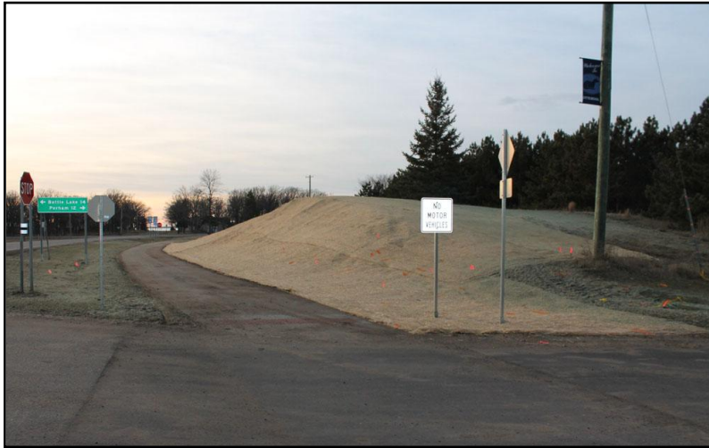
Damaged area of 21OT13 after restoration.

The State Archaeologist returned to the site on 10/11/12 and confirmed that the slope had been stabilized and the trail was once more under construction. Heavy clay soil had been placed on the slope and grass matting laid down to prevent erosion. The State Archaeologist visited the site again on 11/20/12 to photograph the area after completion of construction.