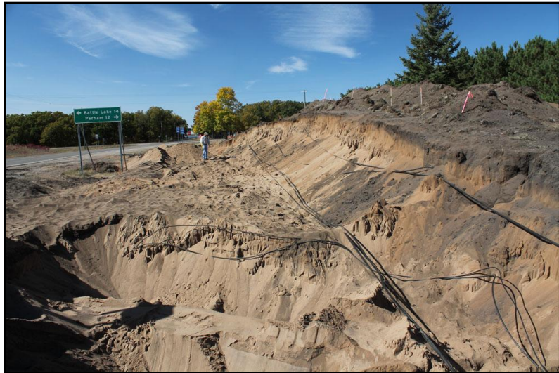
OSA's Bruce Koenen examines the grading damage to 21OT13 in Otter Tail County.

On 9/24/12, a MnDOT archaeologist contacted the State Archaeologist about a report of bones being found by the trail construction. The State Archaeologist informed MnDOT to tell the contractors to immediately halt all construction. OSA personnel visited the site the next day and noted that the backslope cuts from the trail construction had extended into Mound 18 and the area noted as containing early historic Ojibwe graves. Human remains as well as what appeared to be coffin materials were scattered in the disturbed soil. The ridge through the area was very sandy and therefore subject to slumping due to the steep new cut.