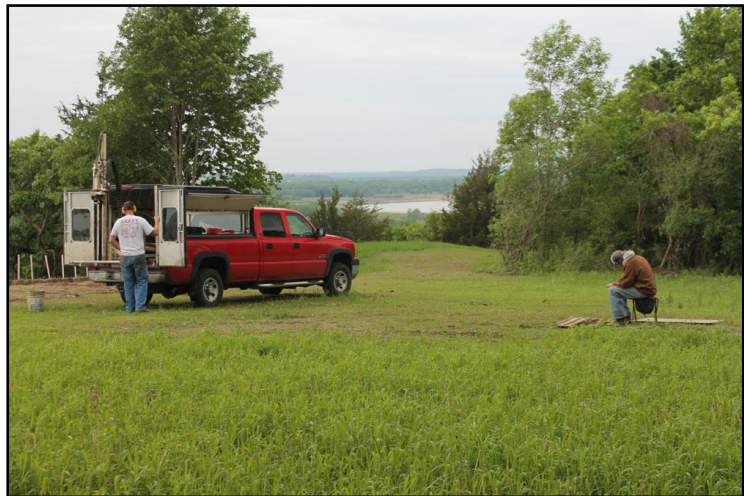
Strata Morph personnel doing mechanical soil coring at 21HE20.

still 15 visible mounds: 1, 8, 9, 14, 15, 21, 22, 30, 31, 40, 41, 42, 43, 47, and 48.