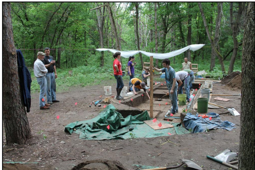
Minnesota State University – Mankato field school in Goodhue County (21GD260)

In FY 2013, the following university-based field research was undertaken in Minnesota: