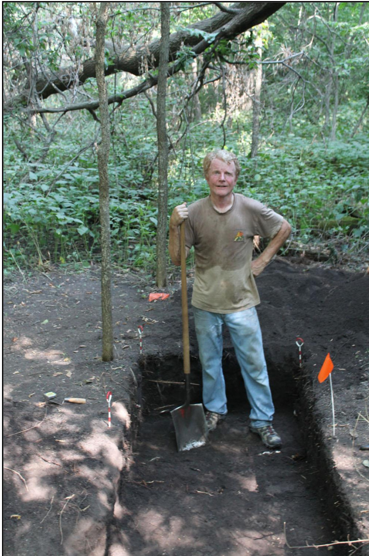
State Archaeologist Scott Anfinson excavating a test unit in Kandiyohi County in 2013 for the Statewide Survey of Historical and Archaeological Sites . (It was a very hot day.)