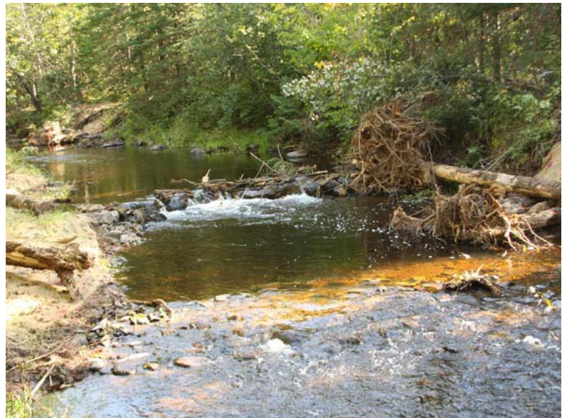
completed rock weir on the Sucker River in St. Louis County