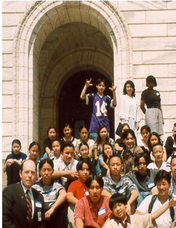
An Asian club and their advisor visits the State Capitol for Asian Pacific American Day.

In the course of conducting the focus groups, students kept on referring back to the Asian clubs as a source of help, support, peer networking, social encouragement, source of information and inspiration. By their words and actions students demonstrated that the Asian Clubs were a very powerful positive resource operating within the schools. The Asian clubs themselves seemed to be helping the students stay in school. The dynamics among the students in the Asian clubs seemed play an important part in the solution. While listening to their peers and hearing from them about their problems they were also learning from them and experiencing the powerful effects of peers supporting peers.