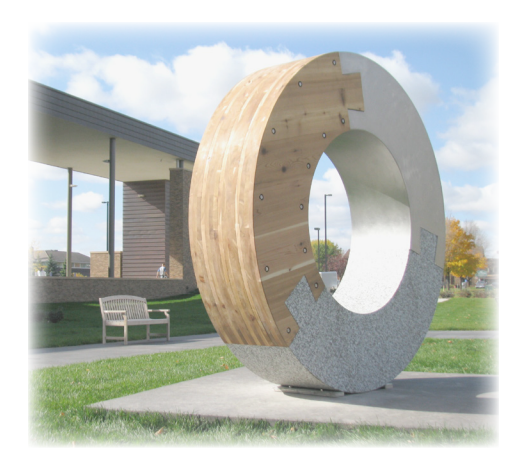
Glazer, Interconnect II