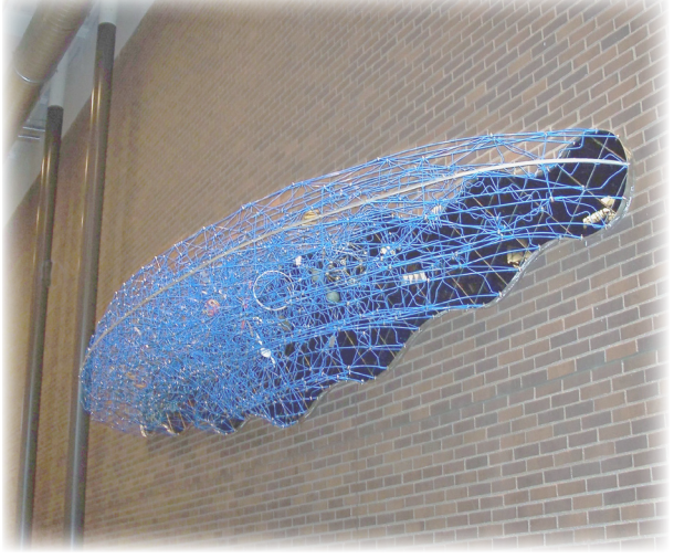
Hatcher, Gravity Wave

Artworks: Interconnect I, Interconnect II