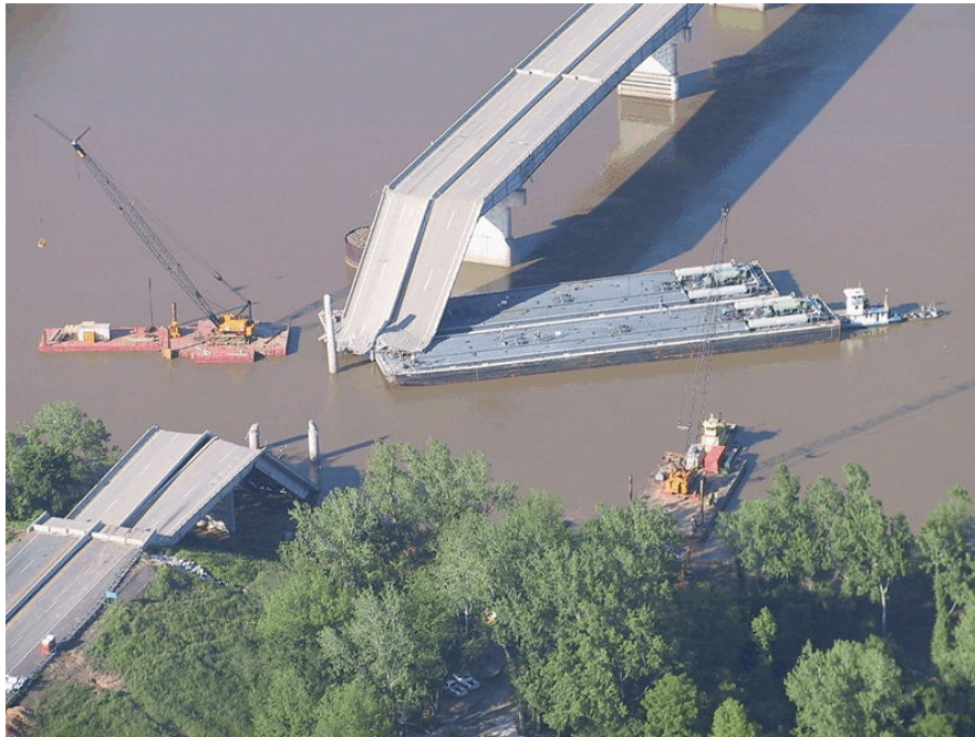
I-40 Bridge, May 31, 2002, WIKIPEDIA (visited Nov. 2, 2007) < http://en.wikipedia.org/wiki/The_I-40_Bridge_Disaster >.

The Interstate Highway 40 bridge over the Arkansas River near Webbers Falls, Oklahoma, was 1,988 feet long and carried an estimated 20,000 vehicles per day. Divers Find Three Victims from Bridge Collapse , CNN.COM (May 27, 2002)