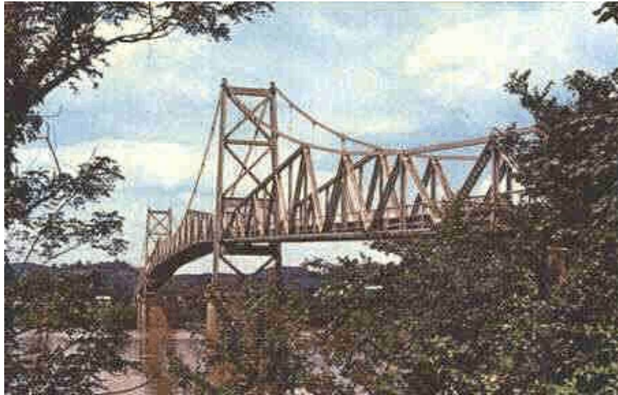
The Silver Bridge , courtesy of Mason County, WV, Web page, Infamous Bridge Disasters (visited Oct. 30, 2007) < http://filebox.vt.edu/users/aschaeff/silver/silver.html >.

The Silver Bridge was completed in 1928 across the Ohio River to connect Point Pleasant, West Virginia, with Gallipolis, Ohio. Its center span was 700 feet and the two side spans were 380 feet. “The bridge was of suspension design with ‘eyebars’ chained together instead of the conventional wire cables. These ‘eyebars’ were linked together with massive pins.” Anton J. Schaeffer, The Point Pleasant/Silver Bridge Disaster (visited Oct. 30, 2007) < http://filebox.vt.edu/users/aschaeff/silver/silver.html >.