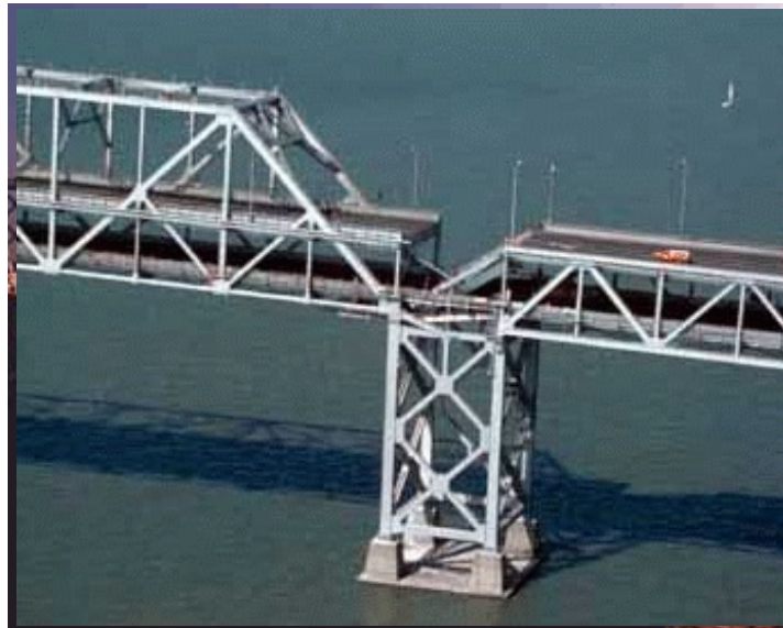
San Francisco-Oakland Bay Bridge Collapse , WIKIPEDIA (visited Nov. 1, 2007)

< http://www.fhwa.dot.gov/environment/justice/case/case5.htm >.