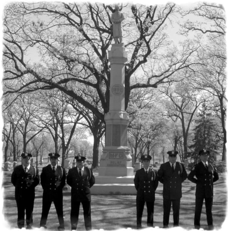
Minneapolis Fire Department Honor Guard