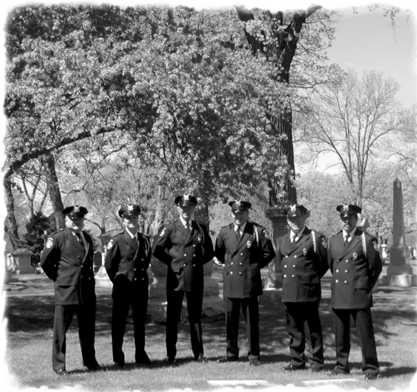
Minneapolis Fire Department Honor Guard