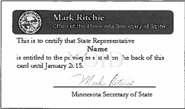
Front of legislative privilege from arrest card